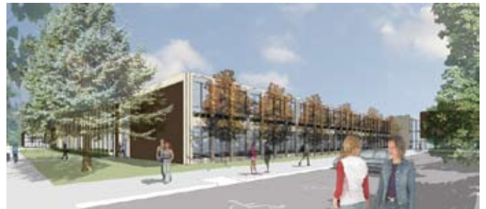
Graphic courtesy of Mahlum Architects, view from 30th and 105th

June to August - field turf replaced. August - demolition starts on existing portables. August - four portables moved to south lot. Late Aug.- temporary classrooms set-up in portables. November - construction on new library and radio/TV additions will start in earnest.