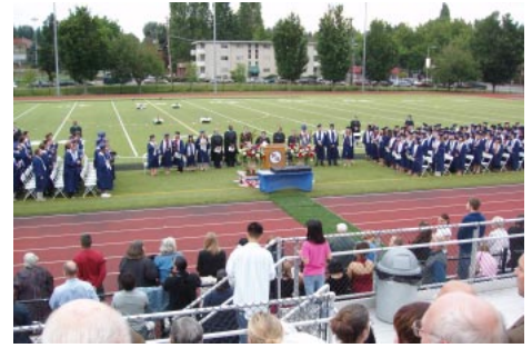
June Graduation at NHHS Field

As many of you know, the district is faced with ongoing budget concerns, growth in the northern neighborhoods, concern over facilities, and importantly, a need to focus on a cohesive academic plan for order in budget and facility needs. Nathan Hale is in the midst of this as we attempt to remain focused on the discussions that impact our student achievement such as small learning communities for all students 9-12, maintenance of student-teacher relationships as a foundation for student success, ongoing refinement of our high academic standards to ensure that students will meet and surpass the graduation requirements including service learning, a culminating or senior project, and successful completion of the WASL. To this end, the district website to support the Superintendent's Community Advisory Committee on Investing