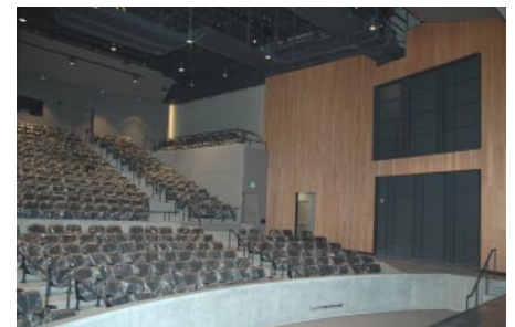
Main house from stage left